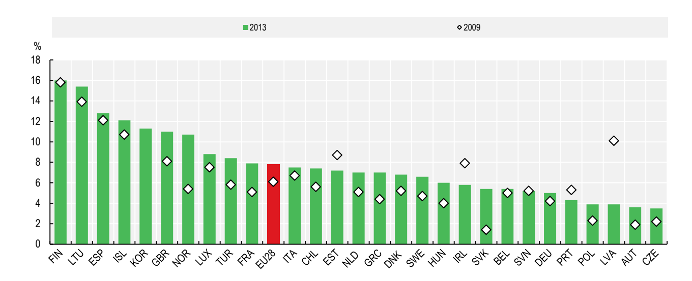
Figure 9. Individuals who participated in an online course